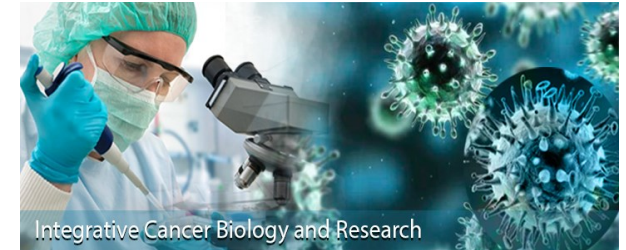
Integrative Cancer Biology and Research

Students are still able to take Dual Credit, Dual Enrollment or AP Classes concurrently while in the Biomedical Science Pathway.